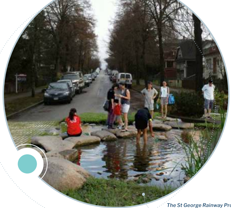
The St George Rainway Project, a community driven initiative that seeks to surface a historic waterway in Mt. Pleasant.

Please let us know if you're taking on the Super Challenge! Email us at info@oneearthweb.org