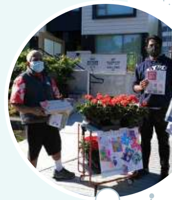
Welcoming new neighbours for Mother's Day at Riverside Gardens.

Explore great resources from Green Bloc , a project that brought together neighbours to find innovative and creative ways to reduce ecological footprints, from their households to their "bloc."