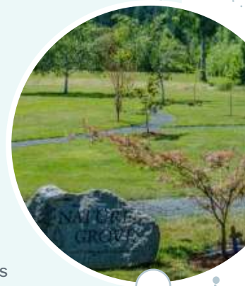
Nature Grove green burial area in Parksville, BC.

Get tips for having a sustainable wedding from Trash Is For Tossers .