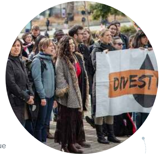
UBC Climate Strike, 2019

Ultimately, lighter living is about living better lives — with a focus on respecting our planet and each other and prioritizing more of what matters, not just more stuff or harmful consumption. Let's build what matters—including health, security, belonging, trust and joy.