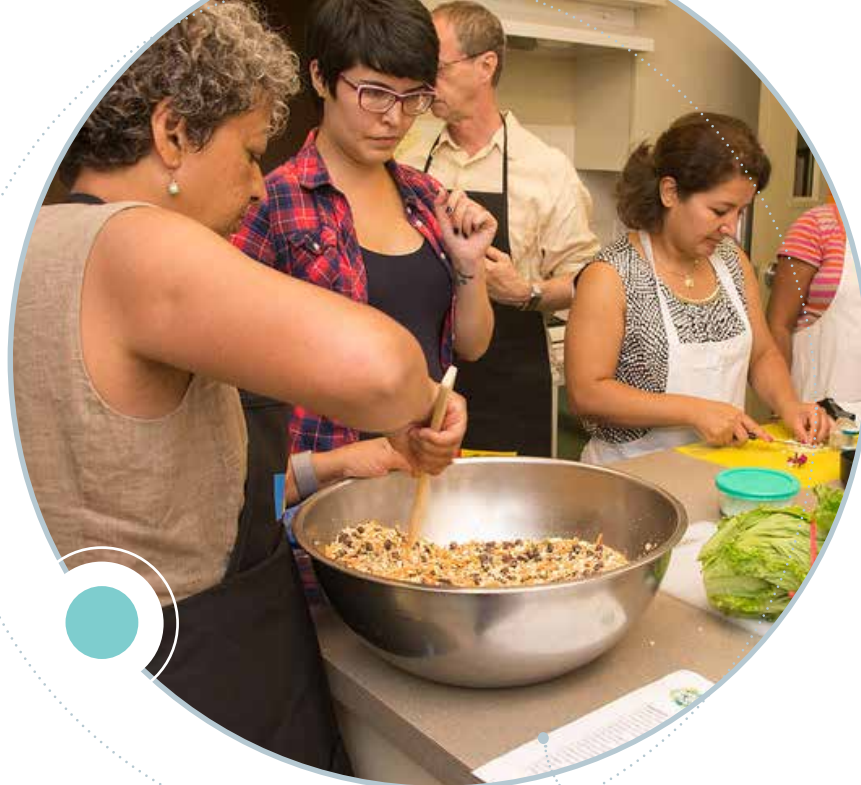
West End cooking workshop

— RESIDENTIAL FOOD WASTE PREVENTION TOOLKIT, BC MINISTRY OF ENVIRONMENT