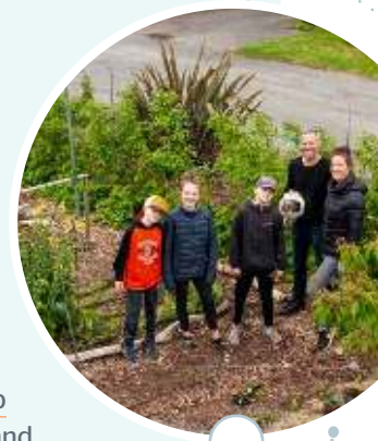
Vancouver Island residents turn their front yards into food gardens amid COVID-19.

Start volunteering, e.g., Fraser Valley Gleaners Society , a faith-based organization reducing food waste by working with volunteers, collecting produce and processing it for distribution to developing countries.