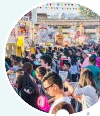
Richmond Night Market

For help with waste management , you can work with groups like the Binnars Project (waste-pickers) to hire folks to monitor disposal stations and make sure items are sorted correctly.