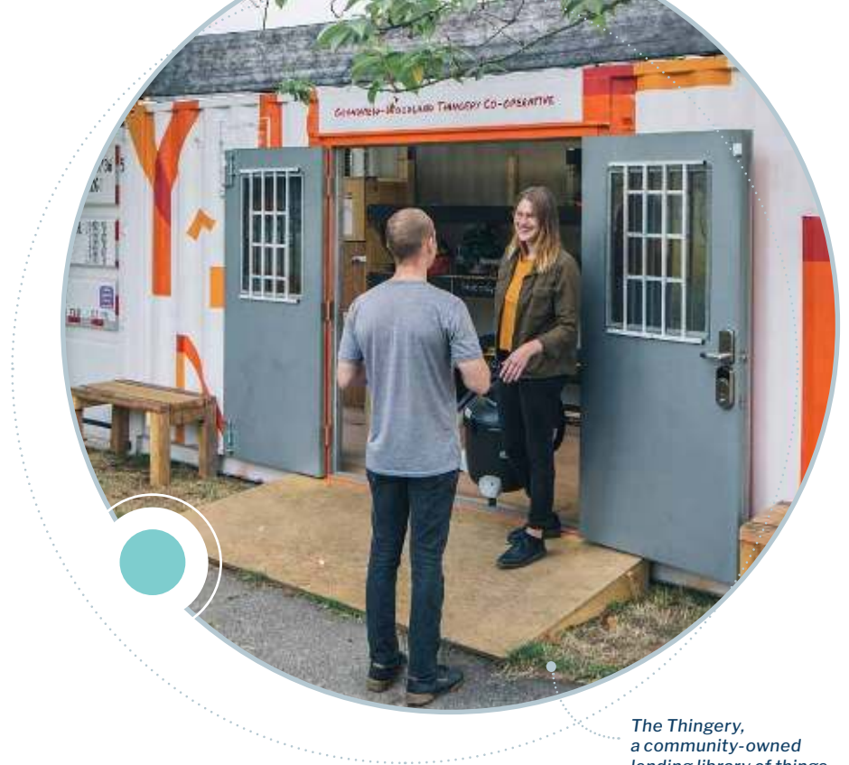
The Thingery, a community-owned lending library of things.