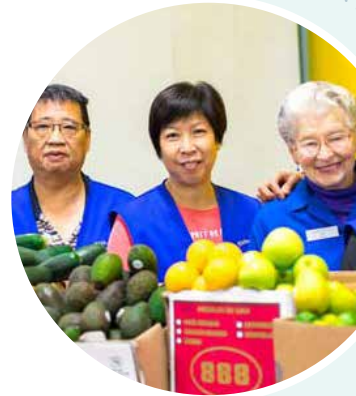
Richmond Food Recovery Network.