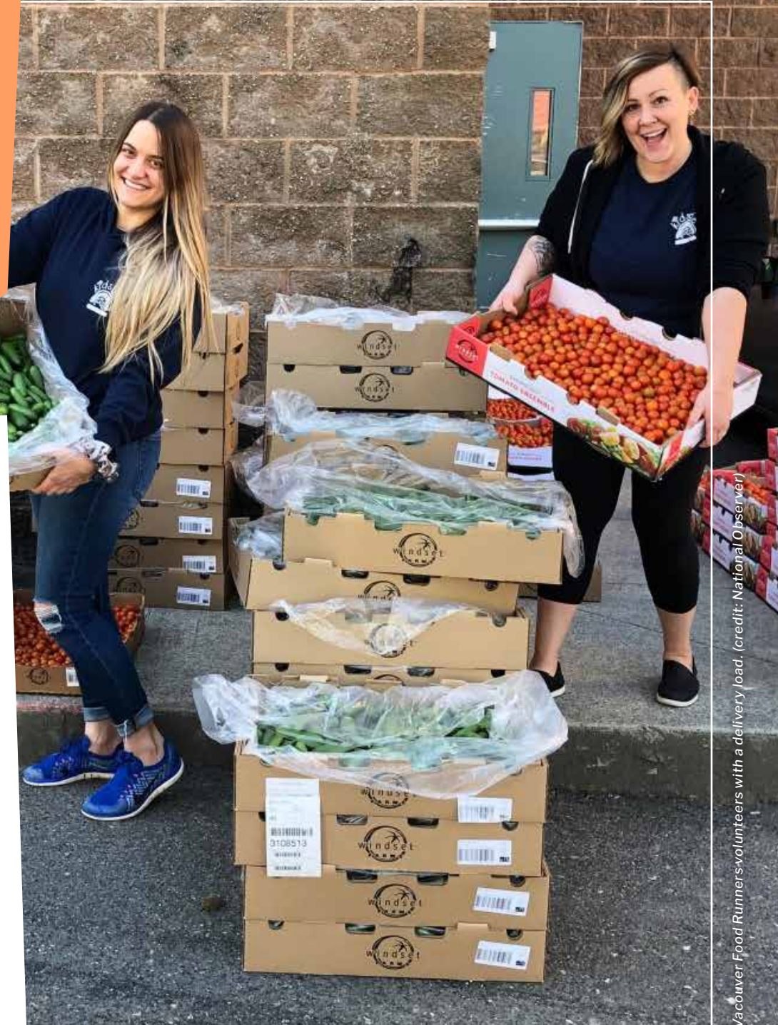
Vancouver Food Runners volunteers with a delivery load.