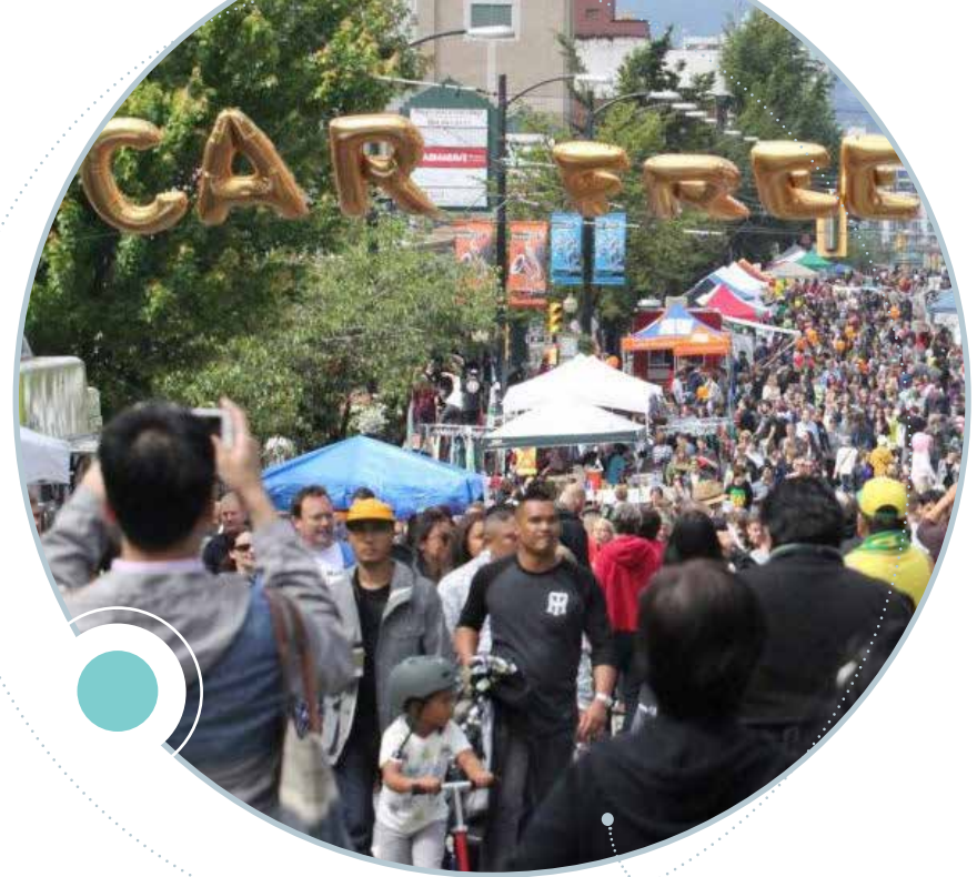
Car Free Day 2016: Main Street from Broadway to 30th Avenue, Vancouver.

There are 100s of block parties every year in Metro Vancouver — and more across BC. You can apply for a $500 Neighbourhood Small Grant to support a local project: neighbourhoodsmallgrants.ca