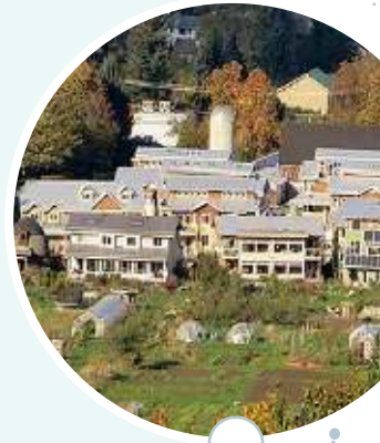
Groundswell Cohousing at the Yarrow Ecovillage.

E-bikes for cargo transportation started as a pilot in Vancouver in May 2021 to reduce traffic congestion and air pollution from trucks. The pilot will have e-bikes transporting cargo from micro hubs to their final destinations.