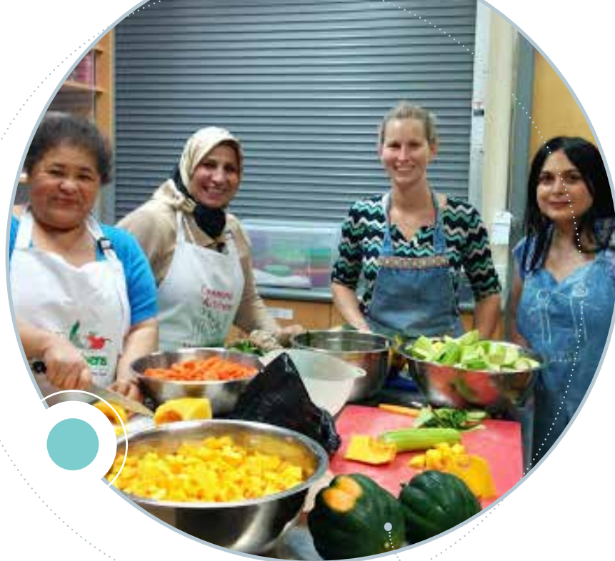
Members of the South Vancouver Food Network (SVFN) prepare a meal.

Creating connection and a deep sense of community is a key part of impactful change towards lighter living and equitable wellbeing for all.