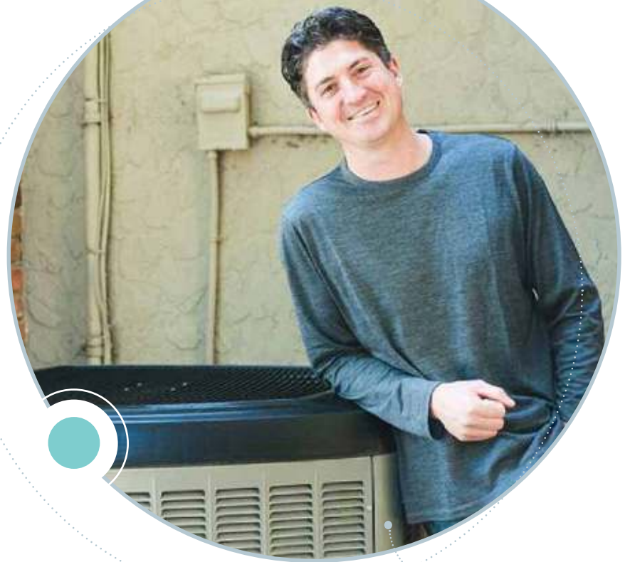
Installing a heat pump can lead to big wins for the climate.