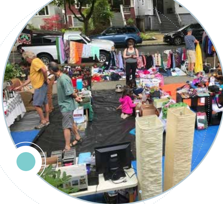
Amma Vancouver Annual Garage Sale.