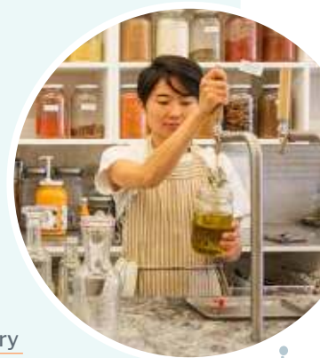
Refillable products. (credit: Fahim Kassam, courtesy of Scott & Scott Architects)

Zero waste campaigns like Trash Is For Tossers and My Plastic-Free Life promote engagement with low-waste lifestyles, while strategies like the City of Vancouver's Single-Use Item Reduction Strategy provide government support for minimizing waste.