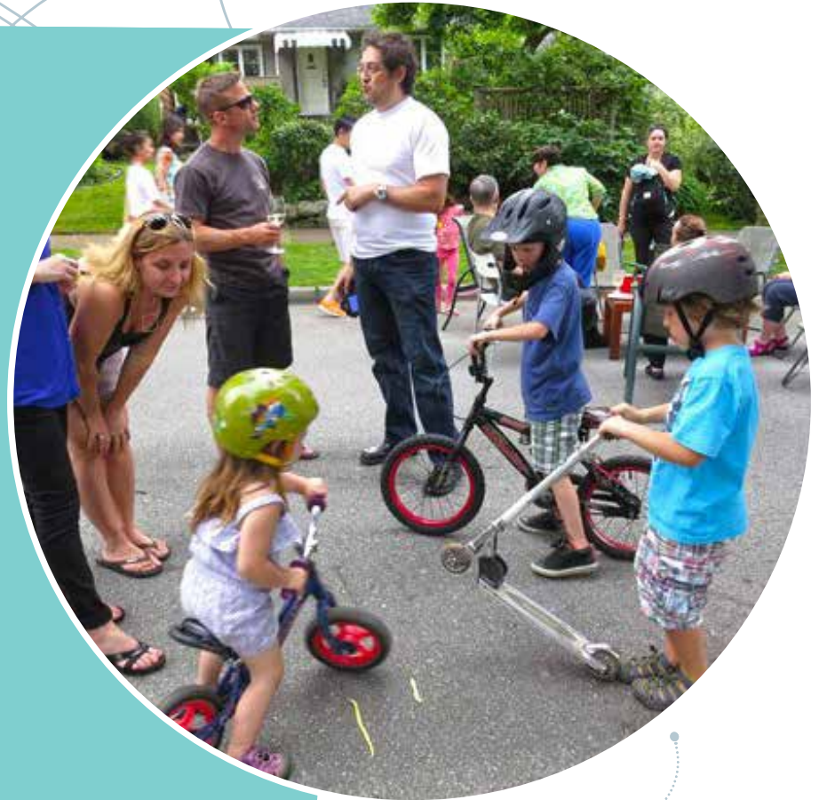
Kitsilano Neighbourhood Block Party on Car Free Day Vancouver Weekend, 2019.

The Neighbourhood Small Grants team assisted organizers in applying for permits from the City of Vancouver, coordinating street barricades, featuring the local business improvement association (BIA) in gift baskets, and creating a space that encouraged connection and community.